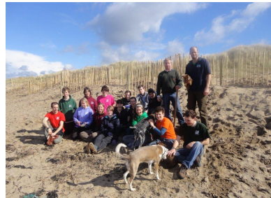
Young volunteers from Bristol University who gave up their weekend help with the scheme

Printed by Printshop UK Ltd Old Ice Factory, Barnstaple EX31 1JP