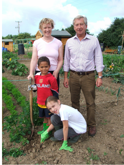
We are now on the lookout for a similar allotment site at Roundswell. Your suggestions are welcome!